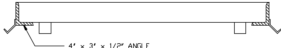
SECTION A - A